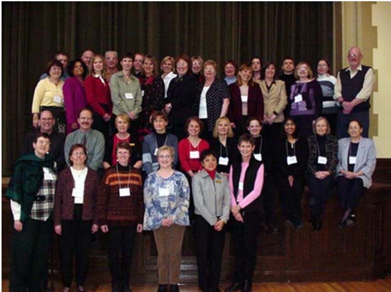
AAFL 30 th Anniversary Meeting April 3, 2003

Have a good summer, and see you at the fall meeting in Edmonton!